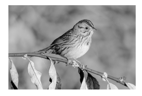
Lincoln's Sparrow.

Organized by the Pennsylvania Society for Ornithology, the PAMC is part of a larger continent-wide migratory bird survey and a celebration of the bird migration event.